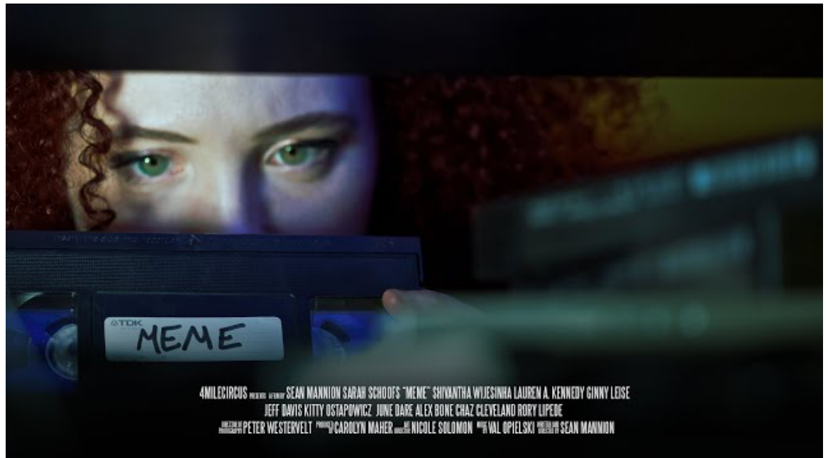
Full trailer for Meme .

referring to David Cronenberg's 1983 film starring James Woods about a television executive who encounters a strange broadcast signal depicting macabre images of violence. "I've always been a big fan of that movie and I had this loose sequel to it, and I thought, 'why don't I take this story that plays with my interest in analogue tech and relationships between people, and between people and technology,' and it started to grow out of there."